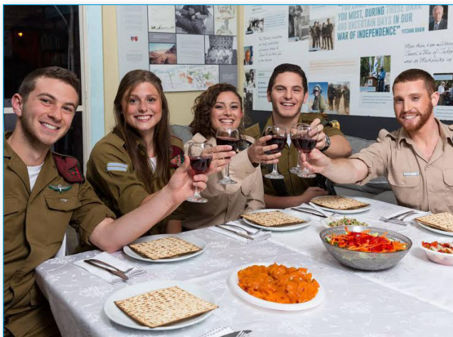
Lone soldiers enjoy a Passover seder together in 2018. During the COVID-19 pandemic in 2020, Lone Soldiers received food packages with seder supplies for Passover.

Passover will end in a few days. Most Lone Soldiers have not seen any family members for over a year, since before Passover 2020 began. COVID-19 caused the cancellation of all trips home and parental visits.