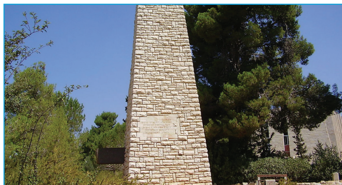
Photo license link: https://commons.wikimedia.org/wiki/File:Mickey_Marcus_Memorial_near_Abu_Ghosh,_Israel.jpg